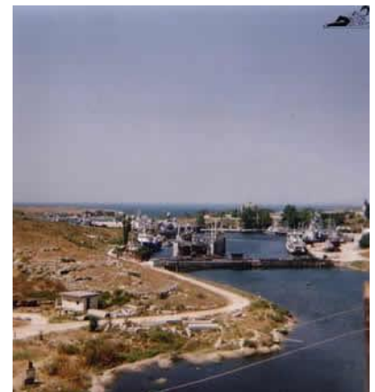
One of the smaller bays in the Sevastopol area

After 1945 Sevastopol became the base of the Black Sea Fleet and a 'closed city'. Like many other places in Soviet Union that were considered of crucial importance to the country's defense foreigners were not allowed to enter it, and Soviet citizens could only enter it with special permits. Any kind of tourism, both national or international, was impossible. Even those who were given special permits could only obtain them if they had relatives in town or if they were working there. These permits were furthermore restricted in quantity, both in numbers of the individuals they were issued to, and in length and frequency.