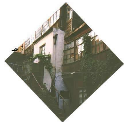
A courtyard in Feodosia, very typical for the towns on the Crimean coast.