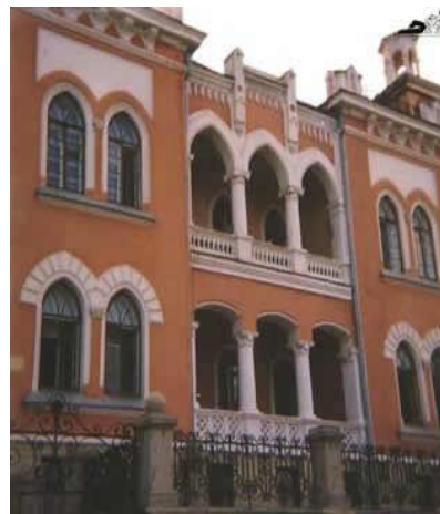
Building at the sea promenade

Feodosia already in it's name preserves the Greek heritage of the Crimea. It was founded by Greek settlers in the 5th or 4th century BC and served as a port connecting the Crimea to the motherland, ensuring it's supply with grain. Some centuries later the settlement fell into oblivion and reemerged in the medieval as the Italian fortress of Kafa. Kafa's decline in the 15th century was a consequence of the decline of the Italian merchant republics, and the town was taken over by the Crimean Tartars.