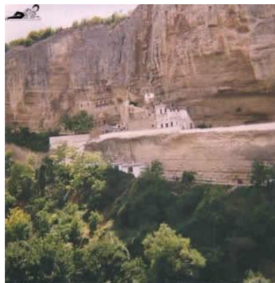
The Uspenskii (= Assumption) monastery seen from across the ravine

The cave-located Uspenskii monastery was founded in Byzanthian times and maintained it's function under Tartarian rule. In Soviet times it was closed but now it has been reopened, restored and enlarged. When I was there in 1996 construction was still on the way but by now it's certainly functioning again as a monastery, with lots of incense passing through the cave rooms and halls.