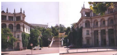
A place in Sevastopol, near the seaside promenade

The status of Sevastopol started to become a big issue after Ukraine declared independence in 1991. Sevastopol, as the base of the Black Sea Fleet, had never been incorporated into the Ukrainian administration. It's destiny had been linked to the one of the fleet. After Ukraine declared independence, the city became entangled in the political-military dispute between the two countries.