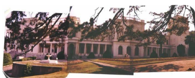
The Livadia-palace, where the Conference of Yalta took place in 1945