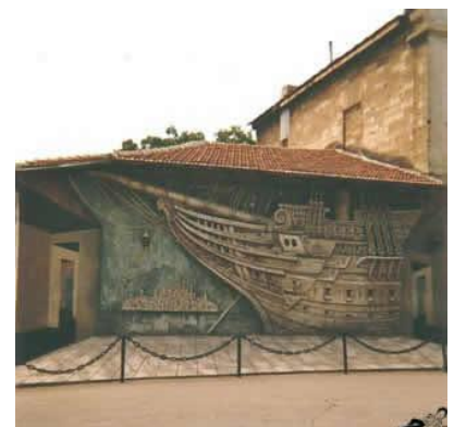
No idea what that is but it looks really nice