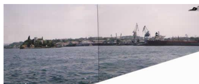
The main harbour in the big bay of Sevastopol

From this one can conclude that all he sees in Sevastopol has been built or re-constructed after 1945.