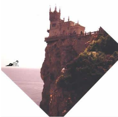
The 'Swallow's Nest', one of the numerous castles and palaces that were built on the Crimea before the revolution

have liked them to impose on the later 'enemy'.