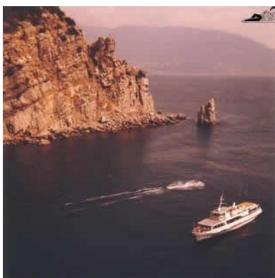
View from the same place across the bay