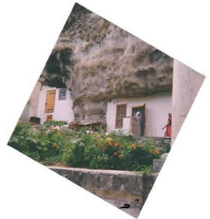
Detail of the residential part of the cave monastery

teries, educational facilities, both by changing legislation favouring the church and by massive funding, as they consider the church a means of appeasement of the discontent masses and a reliable source of mental control of their population.