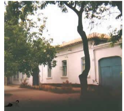
A street in Feodosia preserving the Greek atmosphere

As Crimea became part of Russia no special role was given to Feodosia. It's Greek name was reestablished, as in general Catherine the Great had a faible for Greek names for the settlements in the new Black Sea possessions. She wanted to picture the Russian Empire as a kind of legal successor of ancient Greek culture and the powerful guardian of orthodox Christianity.